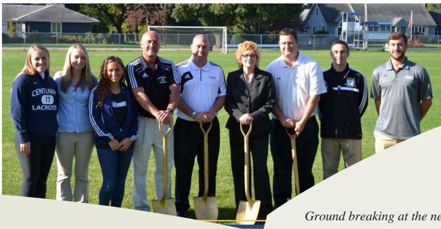
Ground breaking at the new field!

The first phase of the Athletic Turf Project is underway. This first phase will focus on an artificial turf field that will be utilized as the new home for our Men's and Women's Soccer and Lacrosse teams.