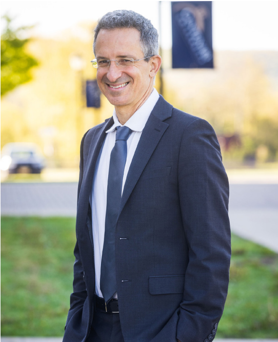
Dr. Tal Ben-Shahar

Dr. Tal Ben-Shahar is an internationally renowned teacher and author in the fields of happiness and leadership.